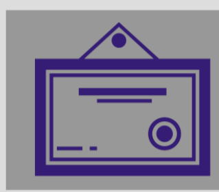
Education and Training