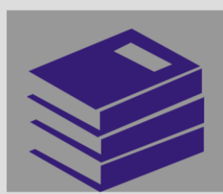
Guidance and Standards

We gather evidence for each regulator to help us see if they have met our Standards of Good Regulation. The Standards describe the outcomes we expect regulators to achieve for their four regulatory functions: