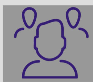
Fitness to Practise