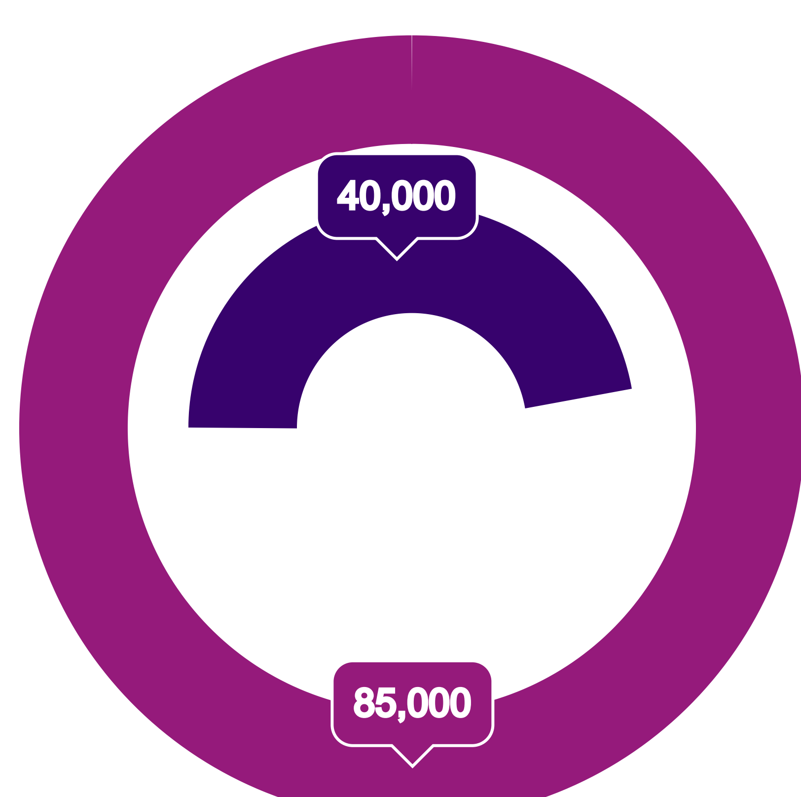
■ Accredited Registers workforce ■ Core public health workforce

We envisage that through greater collaborative working, and greater, high profile support, we could close this gap to improve the programme's public protection function.